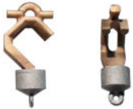
#7 Double Knife Edge

From Top of Conductor Bar to Anode Shoulder: 3-1/2" Knife Edge: 5/8" Thick