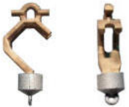
#8 Double Knife Edge

From Top of Conductor Bar to Anode Shoulder: 4-1/2" Knife Edge: 5/8" Thick