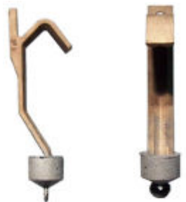
#9 Double Knife Edge

From Top of Conductor Bar to Anode Shoulder: 8-1/2" Knife Edge: 1/2" Thick