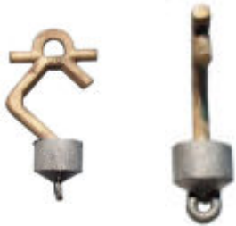
#3 Single Knife Edge

From Top of Conductor Bar to Anode Shoulder: 3-1/2" Knife Edge: 3/4" Thick